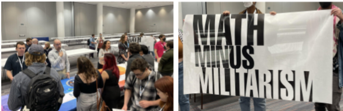
Our banner clearly visible from the NSA table.

We ultimately were able to arrive at a compromise which involved moving the banner to one side of the recruitment table but on a diagonal which allowed it to be even more visible to potential NSA recruits than it had been previously. This compromise allowed us to de-escalate the situation with the AMS and remain in place until the end of the career fair.