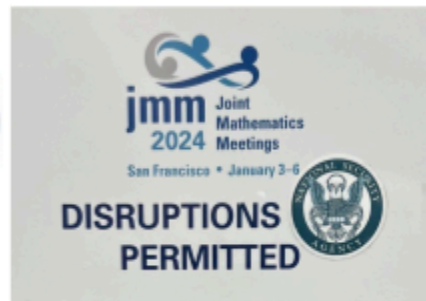
Our stickers decorating signage, water fountains and sculptures during JMM. A close up of our new more honest design of the NSA logo.