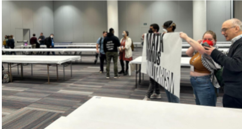
Banner at the almost empty JMM Career Fair.