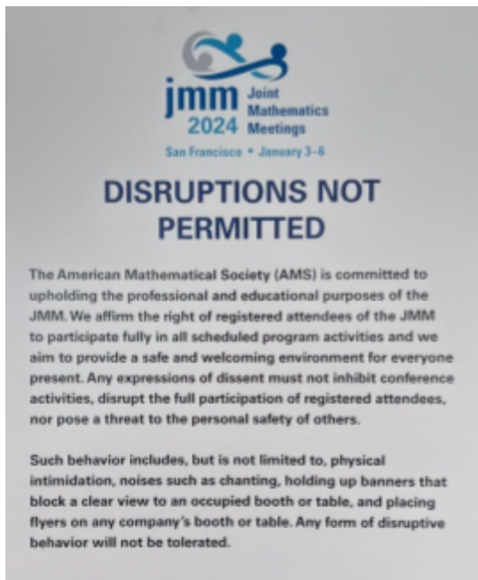
Newly added JMM disruption policy signage.

“Such behavior includes, but is not limited to, physical intimidation, noises such as chanting, holding up banners that block a clear view to an occupied booth or table, and placing flyers on any company’s booth or table. Any form of disruptive behavior will not be tolerated.”