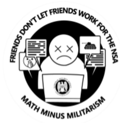
Sticker of 'Friends don't let friends work for the NSA.'

It was a beautiful sunny day in San Francisco, unfortunately we were in the basement of the Moscone Center in a gigantic windowless room filled with empty tables except for a handful of military, intelligence, and defense recruiters at the entrance. Our goal was to disrupt the NSA's recruitment of mathematicians at the 2024 Joint Mathematics Meeting and we were off to a strong start when the NSA recruiters decided not to show up until 30 minutes into the 2 hour career fair.